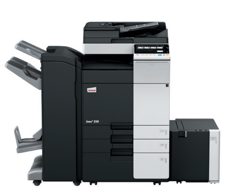
ineo+ 258 with dual scan document feeder (DF-704), staple/booklet finisher (FS-534SD), large capacity tray (LU-302) and paper feeder (PC-410)