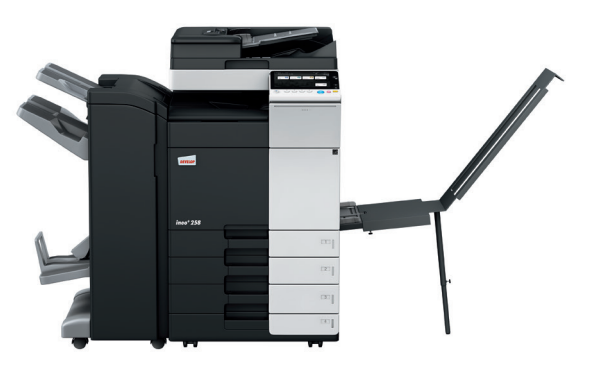
ineo+ 258 with dual scan document feeder (DF-704), staple/booklet finisher (FS-534SD), banner tray (BT-C1e) and paper feeder (PC-210)